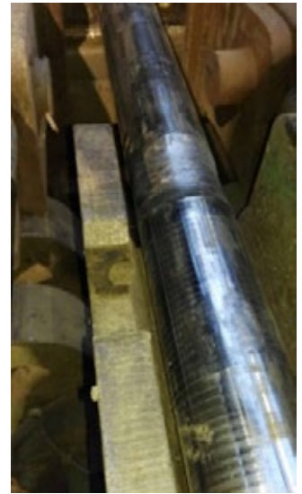
Toolox® 44 hammer pin