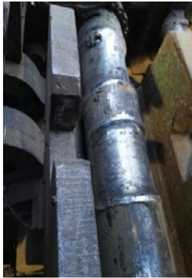
Standard 4340 hammer pin

Using Toolox® gives the guarantee of knowing the origin of the steel. All bars are ultrasonically tested. The hardness and crack resistance are guaranteed for all bars delivered.