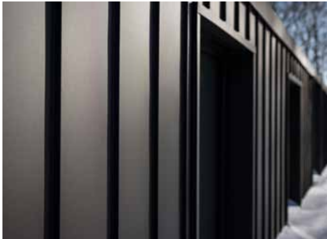
PHOTOS HOUSE IN THE MOUNTAINS: MACIEJ LULKO, POLAND. COPYRIGHT: SSAB